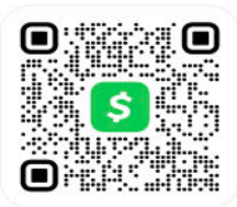
Sunshine Cathedral Scan to pay $SunshineCathedral

Venmo or CashApp Venmo - @SunshineCathedral CashApp - $SunshineCathedral Text to Give - 954.399.7333