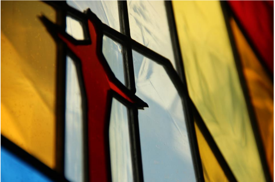
One of the sanctuary windows, Sunshine Cathedral Ft. Lauderdale, FL

Omnipresent Life is my life; It expresses through and as me. I am an individuation of the Whole, a unit of Pure Consciousness. As I am one with divine Life and within divine, universal Life is all that I need to experience happiness, abundance, harmony, love, and good health, I affirm that my good is at hand and there is nothing to keep it from me. I accept my good gladly and I give thanks for it. And so it is!