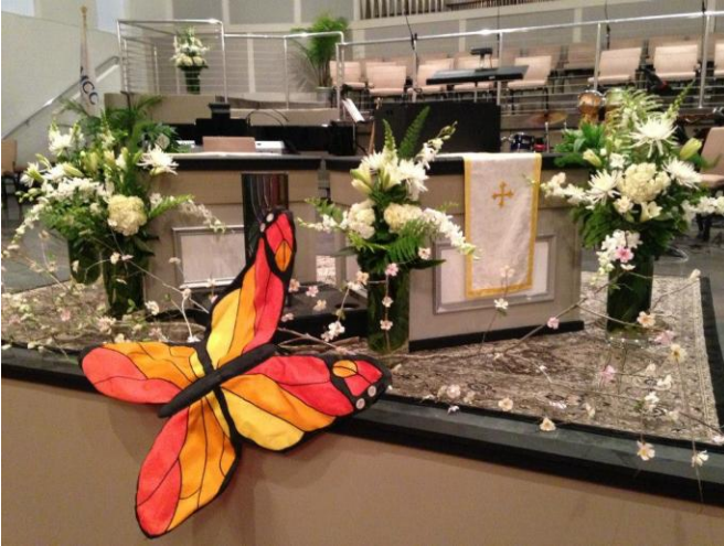
Easter Altar, Sunshine Cathedral, 2013 (Ft. Lauderdale, FL)

I deny that there is any power other than you. There is nothing to block, hinder, or oppose the blessings you have to give. And I affirm that since you are All-in-all and you are All Good, the Good I can imagine and believe I deserve is already mine to experience. Holy One, let my good be made manifest in abundance! Thank you, thank you, thank you, unlimited Source! Amen.